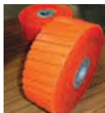
Wheels & Pulleys