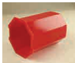
Barrel & Lids