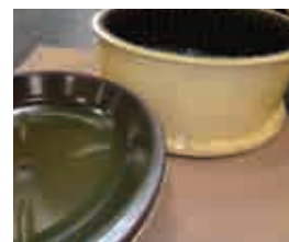
Bowl & Spinners