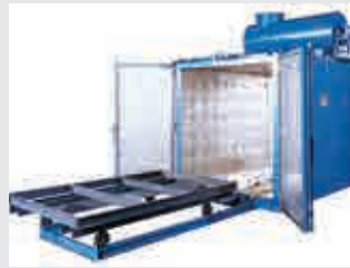
ENVIRONMENTAL BURN OFF